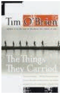
The Things They Carried By Tim O'Brien

Elizabeth Public Library (EPL) will work with Kean University on a National Endowment for the Arts (NEA) funded Big Read project. Members of the communities served by Kean University and Elizabeth Public Library